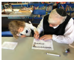
See p. 6 for more photos.