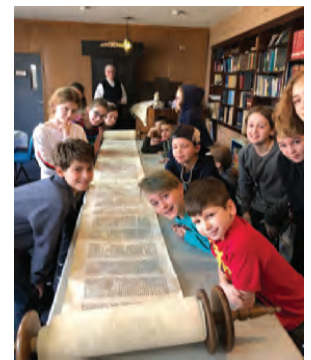
Students from the Simcha Learning Center being instructed on how Torahs are written. See p. 4 for more information and photos.